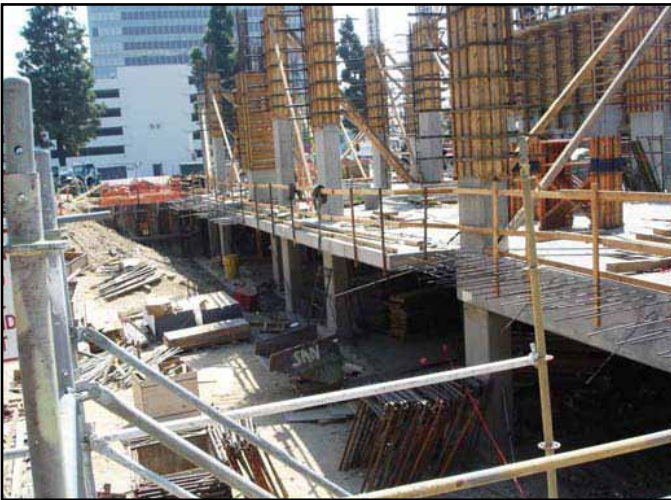
Figure 4: P1 slab in place, construction proceeds upward in up-down zone

Within the up-down zone of the site, a temporary low-strength concrete waste slab was then poured on grade to allow a smooth forming and working surface, followed by the placement of the P1 basement slab. With the sheet pile walls, drilled shafts, columns and P1 slab now in place, tower construction could proceed upward prior to further excavation downward. Columns, shear wall cores, and slabs up through the 4th floor were placed in conventional fashion, with the P1 slab used as the base of re-shoring. See Figure 4.