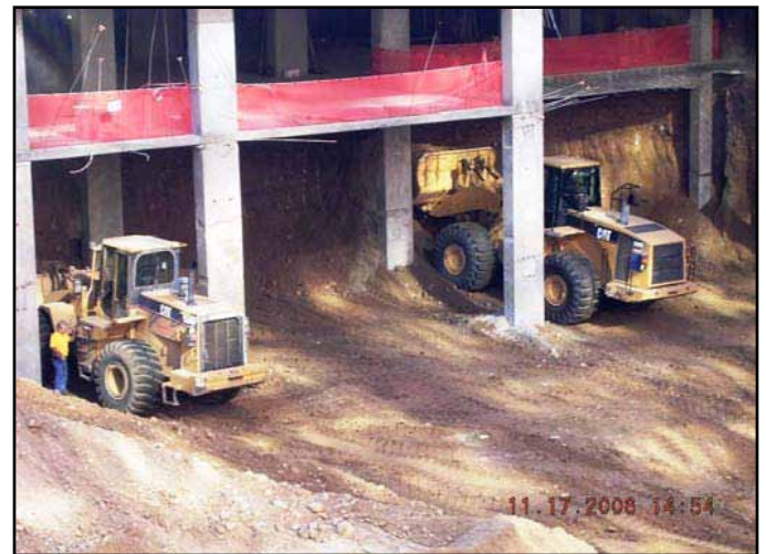
Figure 5: Mining excavation beneath P1 slab

Precast concrete was chosen for the two-story gravity columns extending from the P3 to P1 basement levels within the up-down zone due to its compatibility with the remainder of the concrete construction. Vertical reinforcing bars were extended below the bottom ends of the columns to provide a compression lap splice into the drilled shaft below, and extended above the top end of the columns to be lap-spliced or mechanically coupled with the reinforcing bar for the cast-in-place columns above.