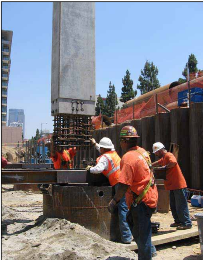
Figure 7: Lowering precast gravity column into place

Given the inherent uncertainties associated with completing a blind wet-set rebar connection 25-feet down a hole, high-strength non-shrink grout was subsequently pumped thru a 2-inch-diameter port at the center of each precast column into the column-to-shaft joint to ensure complete and competent contact bearing between the underside of column and top of drilled shaft below.