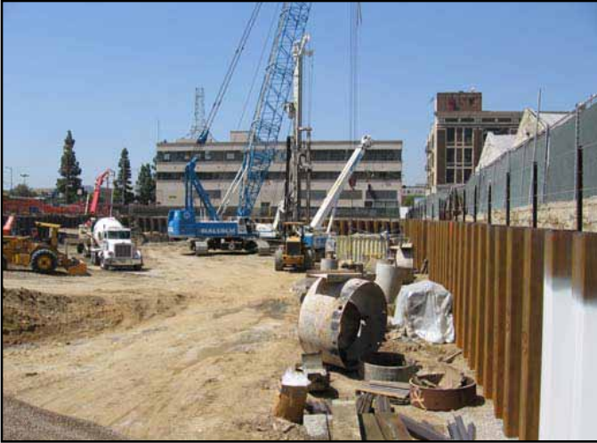
Figure 3: Excavation to P1 level

Within the up-down zone of the site, a temporary low-strength concrete waste slab was then poured on grade to allow a smooth forming and working surface, followed by the placement of the P1 basement slab. With the sheet pile walls, drilled shafts, columns and P1 slab now in place, tower construction could proceed upward prior to further excavation downward. Columns, shear wall cores, and slabs up through the 4th floor were placed in conventional fashion, with the P1 slab used as the base of re-shoring. See Figure 4.