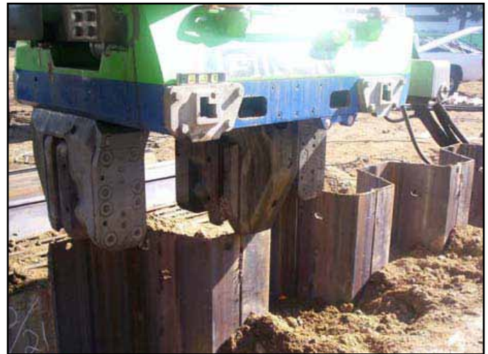
Figure 2: Installation of sheet piles

Sheet piles extending 15 feet below the underside of the eventual P3 basement level was first placed on the east, west and south sides of the site by utilizing a push press driver with an integrated auger bit to help clear cobbles. This sheet piling, with an 18-inch deep profile and nearly 3/4-inch flange thickness, would eventually become the finished basement walls.