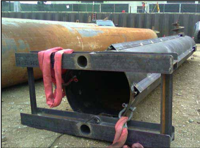
Figure 6: Column installation template

elevation until the concrete within the drilled shaft set up sufficiently to support the weight.