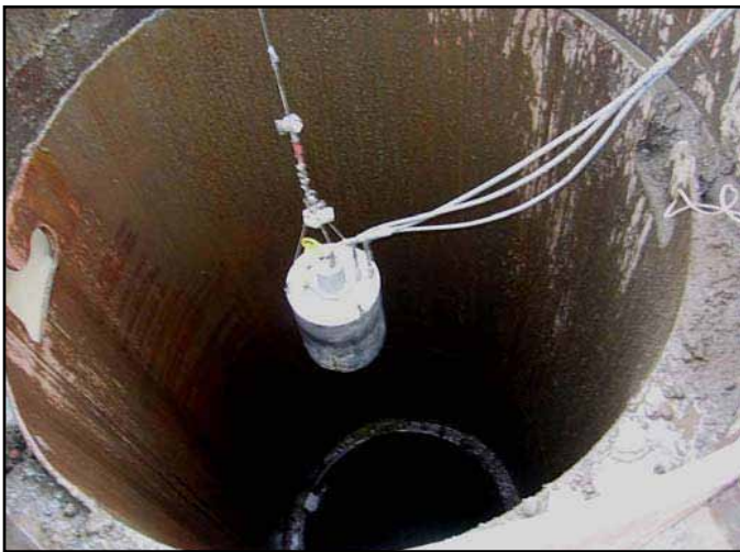
Figure 10: Drilled shaft inspection device

To perform the necessary bottom observation, a customized drilled shaft inspection camera (DSID) was fabricated by the geotechnical engineer (see Figure 10). The device consists of a 24-inch bell that houses a video camera, water, and compressed air lines. The bell is equipped with notched triangular blades labeled in half-inch increments. When viewed remotely via the fiber optic camera, the depth of penetration of the bell into the bottom of the shaft excavation can be observed.