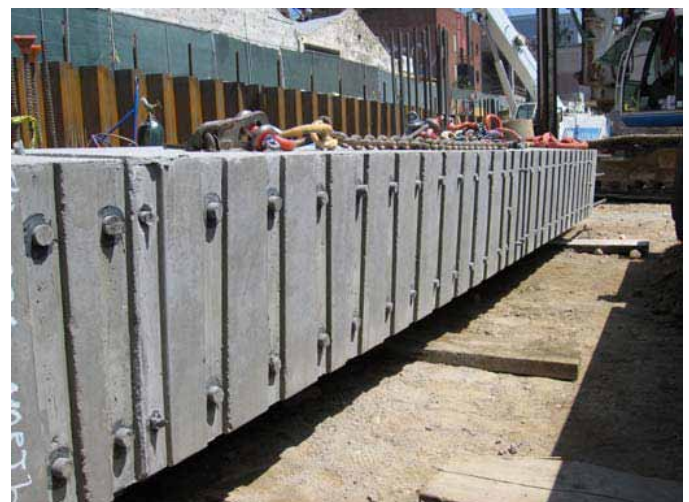
Figure 8: Precast shear wall core corner prior to installation

Construction of the shear walls below the P1 basement level began in much the same fashion as the columns, with L-shaped corners of the shear wall cores plant-cast and set atop large diameter drilled shafts. These corner elements were cast with threaded dowel inserts and horizontal keys along the entire length of those vertical faces in eventual contact with the remainder of the walls (see Figure 8). Instead of rebar dowels at their base, an embedded W12 steel wide flange section with headed shear studs was cast within and extended below each of the L-shaped columns. This W12 shape is wet-set into the drilled shaft below such that it will then be capable of transferring uplift forces due to a seismic event from the shear wall into the drilled shaft. The remaining wall panels between the precast corners were reinforced and cast in place after the completion of excavation within the up-down zone and during subsequent basement construction.