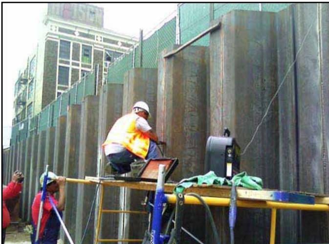
Figure 9: Magnetic particle testing following welding of sheet pile

Sheet pile is traditionally driven in sections with vibratory or impact hammers, with sections joined at vertical interlocks. Due to negative implications of loud hammering or vibration on neighboring buildings in the Los Angeles southern downtown urban environment, as well as the presence of large cobbles at the site, a “silent” press piler was employed to hydraulically jack or press the sheets of pile into place. The press piler was fitted with a pre-auger bit that mitigated the effects of the large cobbles on the installation of sheet pile. The press piler was laser guided, used previously placed sections as reaction piles, and was self-advancing. The noise level during pile installation was roughly the equivalent of that made by a semi-truck and vibrations were virtually non-existent. Following excavation, the interlock seams joining individual sections of sheet pile were welded with non-structural seal welds, which were then subjected to periodic visual inspection and a magnetic particle testing program. These welds completed a basement wall construction type that is an impervious water and methane barrier. See Figure 9.