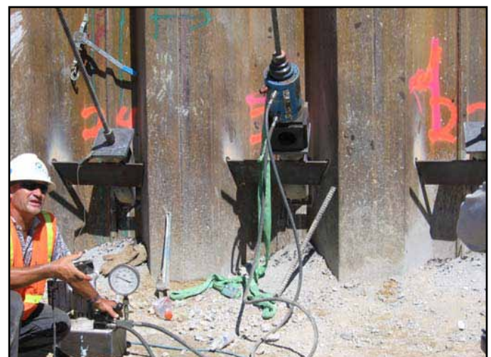
Figure 12: Installation and tensioning of tiebacks at sheet pile within conventional zone

For the temporary shoring condition within the conventional zone, sheet piles were designed as part of a braced system that included tie-back anchors (see Figure 12). For the permanent wall below grade condition and for the temporary shoring condition within the up-down zone, internal bracing is provided by the P3, P2, P1 and ground level floor slabs. Due to the potential for periodic perched groundwater, the lower section of the sheet piles was designed to resist hydrostatic pressure in addition to the active soil pressure loading.