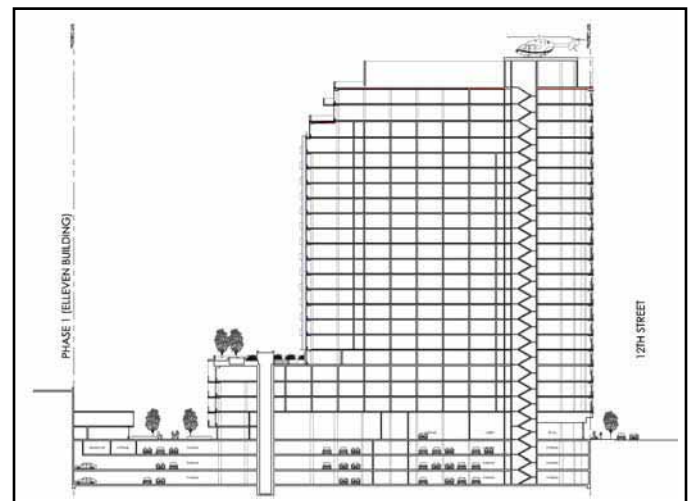
Figure 1: Section thru building looking east

60,000 square feet. It is anticipated for completion in 2008. The building footprint occupies the entire site and is rectangular in shape. It is bounded on the south and east sides by 12th Street and Grand Avenue, respectively; by an alleyway on the west side; and by a recently completed 11-story residential tower with one subterranean level, immediately to the north. See Figure 1 below.