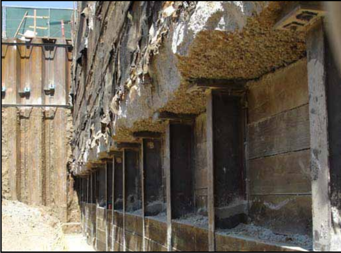
Figure 13: Underpinning at existing DWP vault