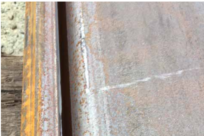
Steelant strongly adheres to steel, but still remains flexible in low temperature conditions.