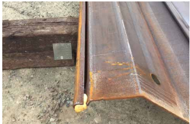
Memory material allows flexing and movement in the sheet pile without loss of the seal.